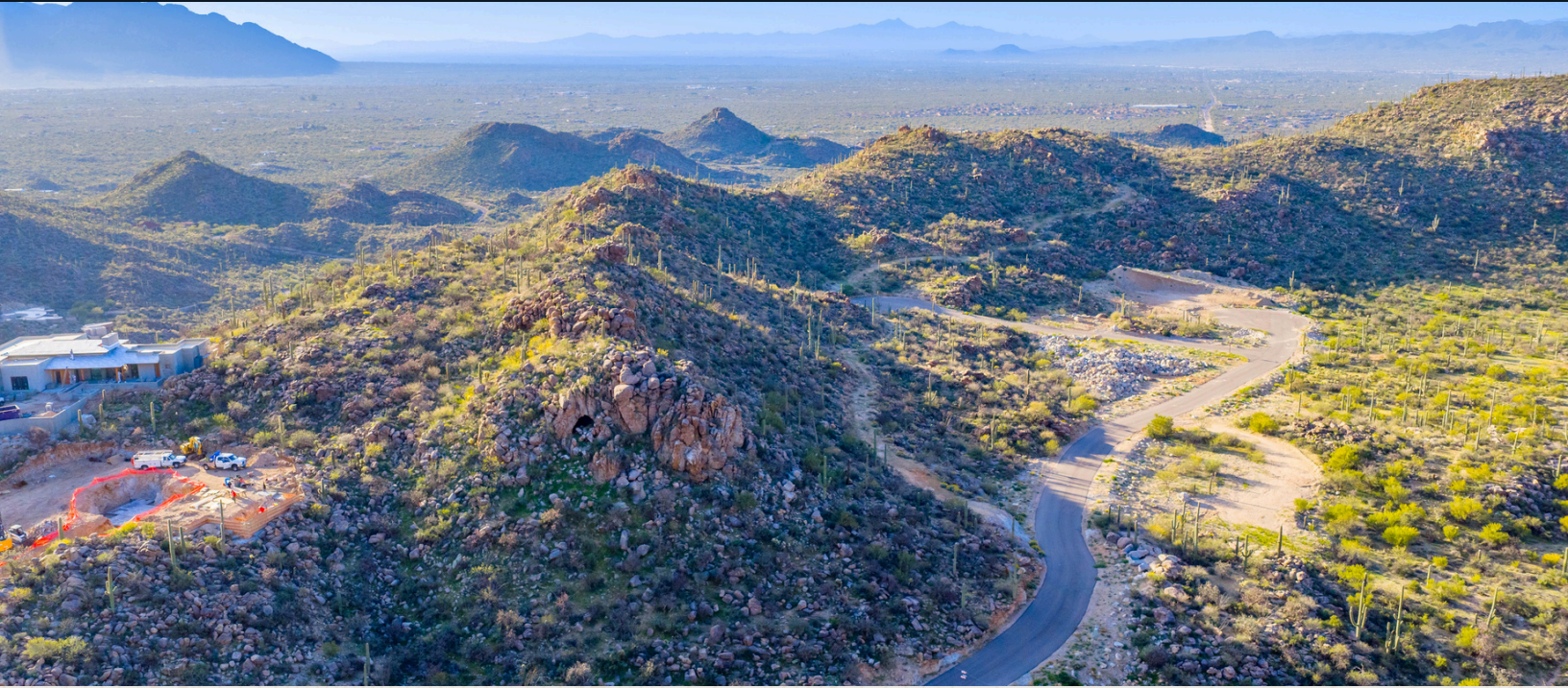
View of Lot #9